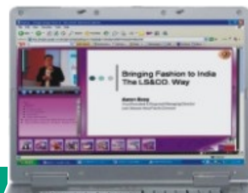
vReach Webcast Screen Live, On-Demand or on CD/DVD.

Opp. Century Mills, P.B. Marg, Worli, Mumbai - 400 013